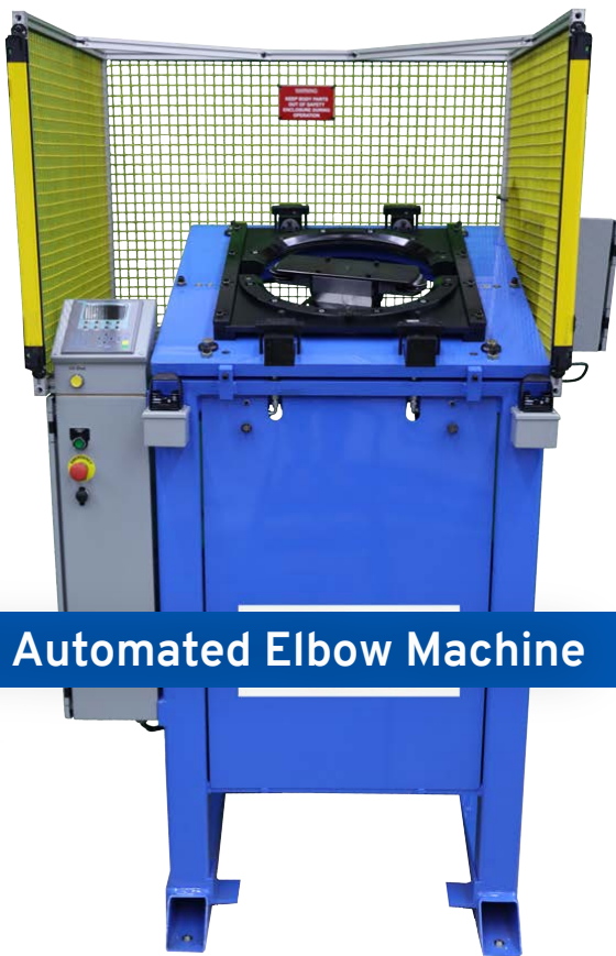
916 Automated Elbow Machine