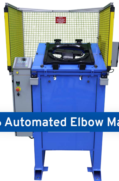
916 Automated Elbow Machine

ABOVE: CTM 916 Automated Elbow Machine Shown with standard light curtains, safety cage, and integrated safety module