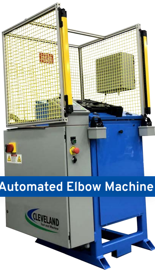
678 Automated Elbow Machine