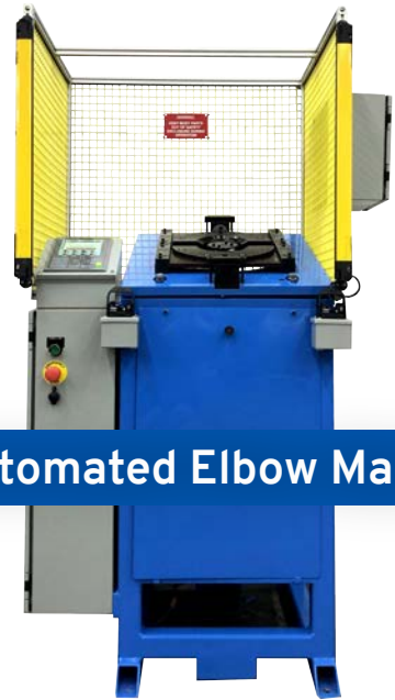
678 Automated Elbow Machine

ABOVE: CTM 678 Automated Elbow Machine Shown with standard light curtains, safety cage, and integrated safety module